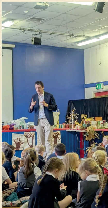
Local school ministry

God is good, all the time! A simple, yet powerful truth. We have seen it time and time again in ministry. As we come to the end of another year, we are so thankful for the faithfulness of our God. Looking back, we have seen His hand in many different ways; even in the challenges and the uncertainties of life – God is good.