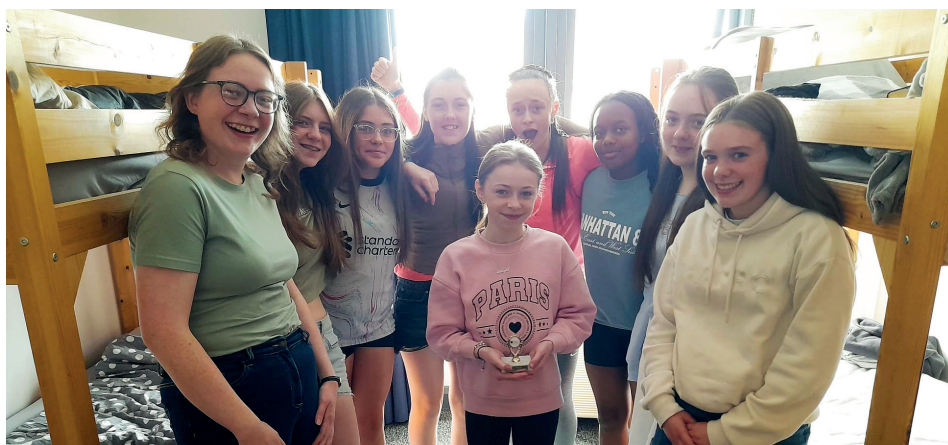
Young people at Camp

What a different world it is now for our young people growing up. Our aim is to help them realise the Great Creator loves them unconditionally and has wonderful plans for their lives when they put Him first. One of our young people said this about her experience volunteering with CEF over the summer: "Helping with CEF this summer at my church's Holiday Bible Club was an incredible blessing. It was so encouraging to see how God brought many children along each day, eager to learn more about Him and His Word. One highlight for me was leading the quiz one day. It was great to see how much the children had taken in, and how engaged they were with the Bible stories. It reminded me that God's Word is powerful and speaks even to young hearts. Throughout the week, I was reminded that while we plant the seeds, it's God who gives the growth. I'm so thankful to be part of His work in the lives of these children. All glory goes to Him!"