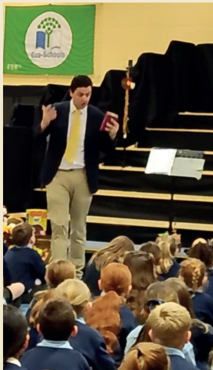
Local school assembly