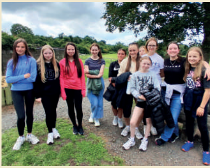
Some of the young people enjoying the Camp Activities