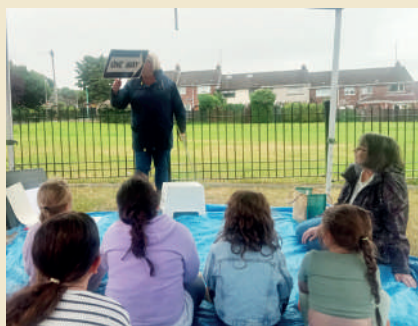
Some of the children reached with the Gospel in Bawnmore