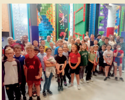
Some of the children at Camp

We have known the presence of God as we have conducted ministry across the local area over the summer months. Back in June we were involved in a number of Bible clubs in schools. During these clubs the children, as well as the teachers, sat and listened to the Gospel being presented through the stories of the 'Paralysed Man' and 'Bartimaeus.' In one school, a Chinese teacher was present during the club. As the Gospel was presented through the Bible lesson, this lady commented to other staff in the school that she had never heard a story about Jesus before. We believe God brought that lady across our path for a reason. It made us think though, how many more people are like her across the district? How many people in our neighbourhoods have never heard the Gospel just once? The fields are white unto Harvest! In a different school club we were approached by another teacher at the end of the second day. After growing up in a non-Christian home, God used an RE teacher in a local Grammar school to bring her to repentance and faith. Now in her 30s she is married to a Presbyterian Minister. Remarkably, her mother works in the school too and heard a clear Gospel presentation that day. It is wonderful how different opportunities present themselves in the schools.