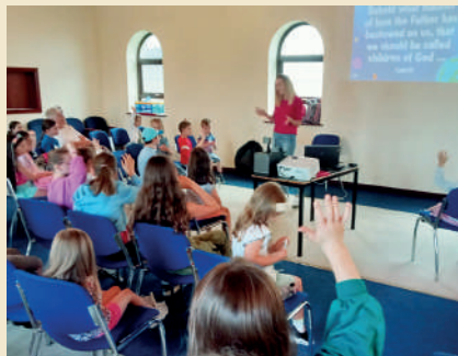
Holiday Bible Club in Greenisland